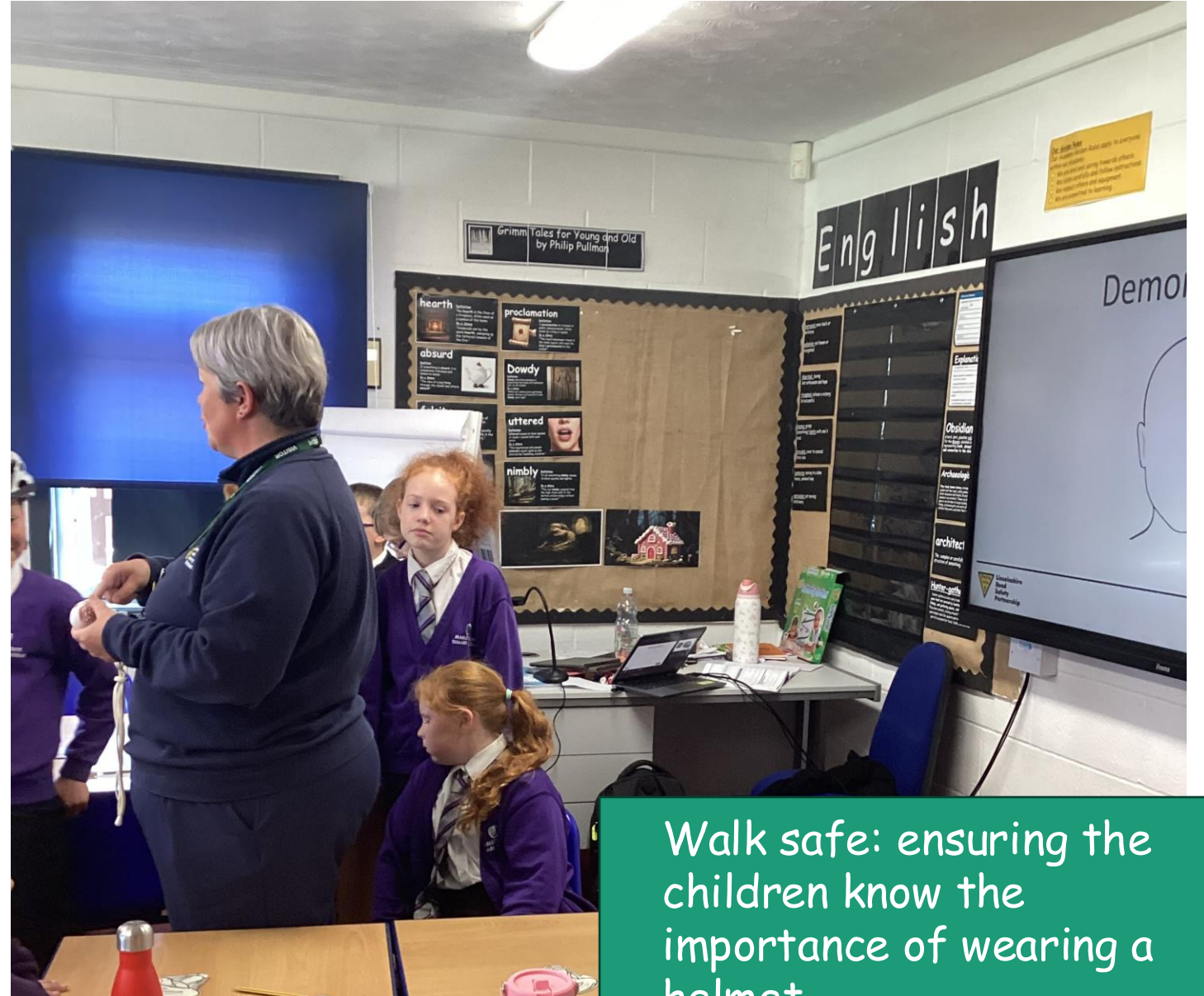
Walk safe: ensuring the children know the importance of wearing a helmet